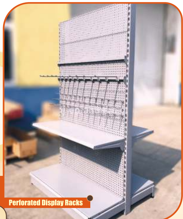
Perforated Display Racks