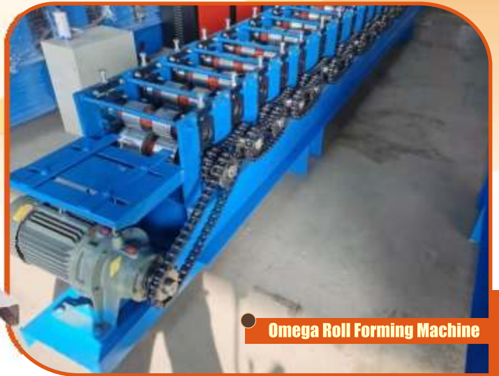
Omega Roll Forming Machine