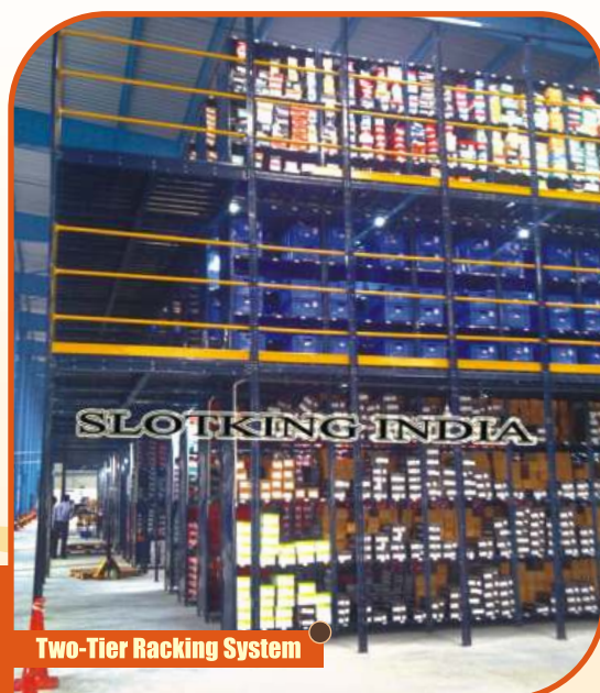
Two-Tier Racking System