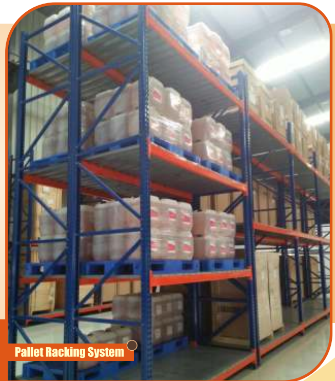
Pallet Racking System