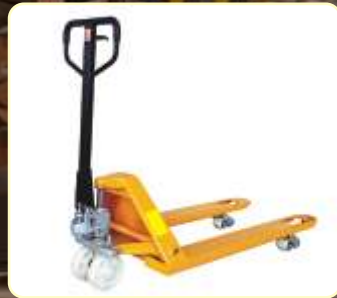
Hand Pallet Trolley