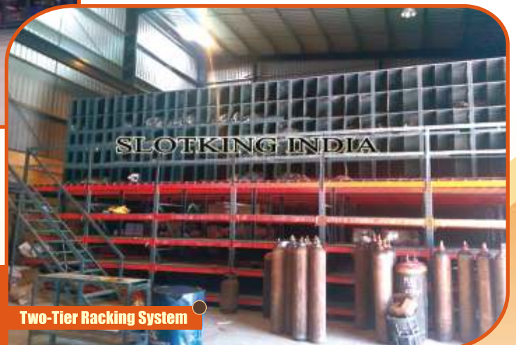
Two-Tier Racking System