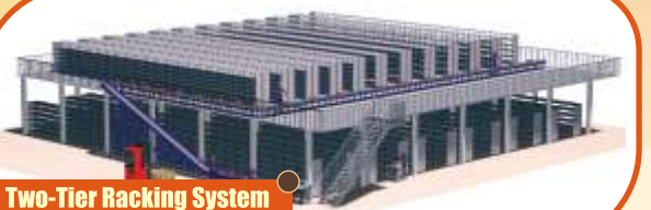
Two-Tier Racking System