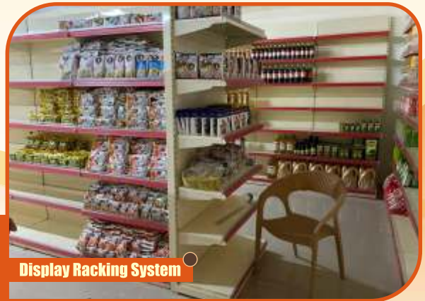
Display Racking System