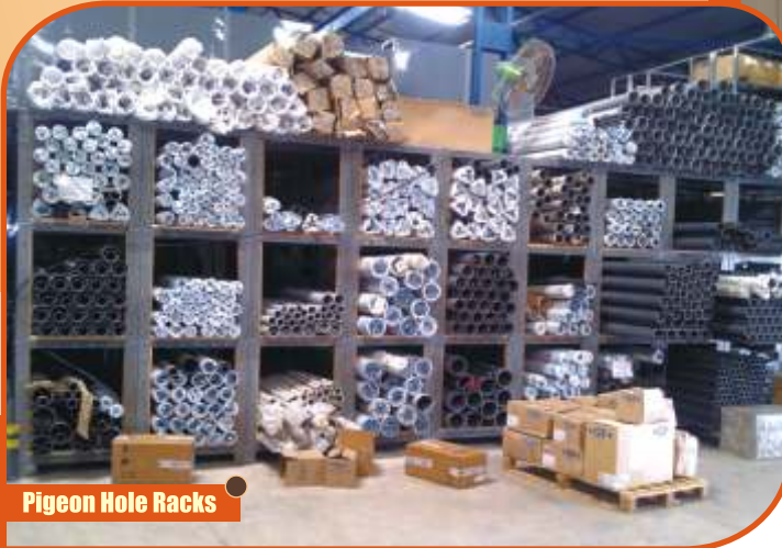
Pigeon Hole Racks