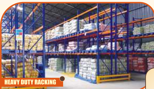
HEAVY DUTY RACKING