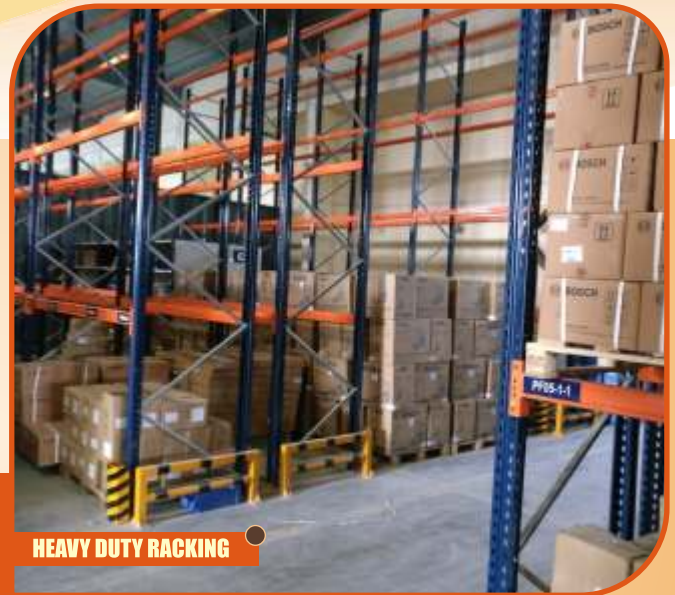
HEAVY DUTY RACKING