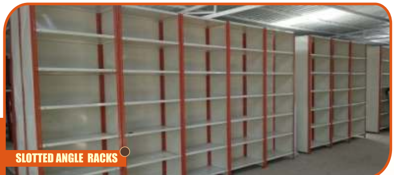
SLOTTED ANGLE RACKS