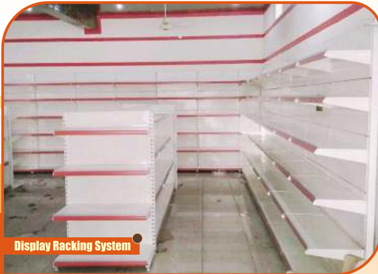
Display Racking System