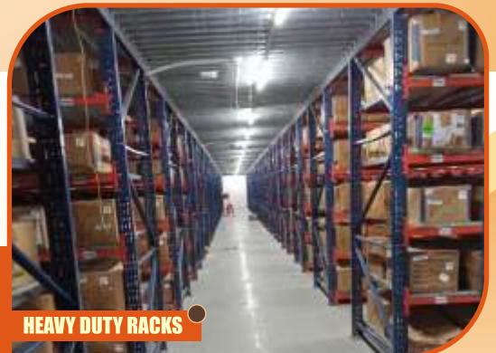
HEAVY DUTY RACKS