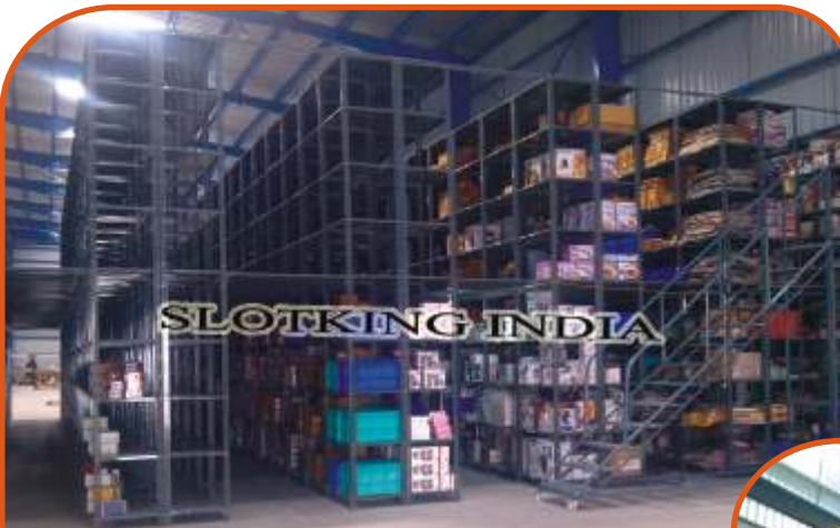
Two-Tier Racking System