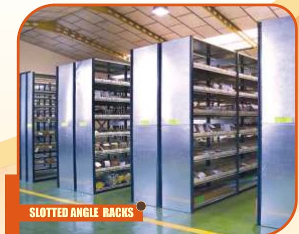
SLOTTED ANGLE RACKS

SLOT KING INDIA STORAGE SYSTEM PVT. LTD. STORAGE EXPERT