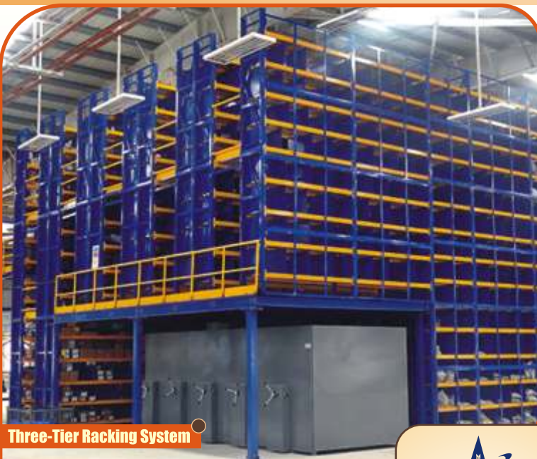
Three-Tier Racking System