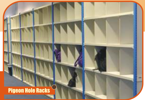
Pigeon Hole Racks