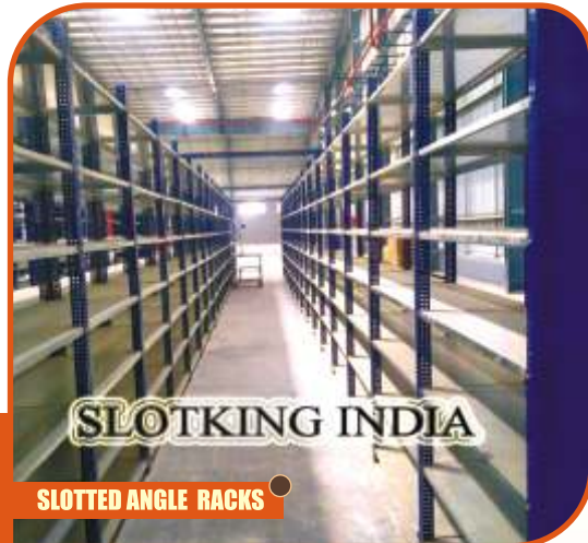
SLOTTED ANGLE RACKS