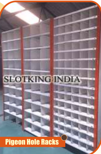
Pigeon Hole Racks