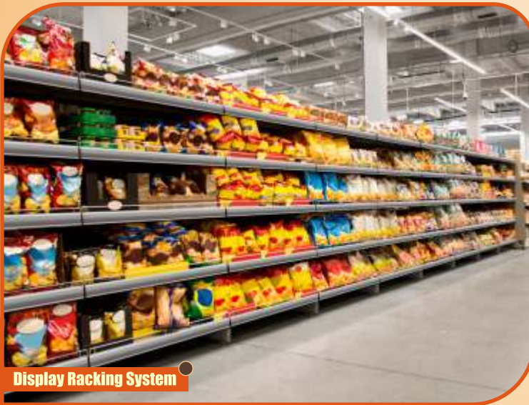
Display Racking System