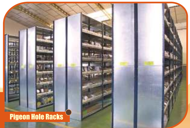
Pigeon Hole Racks