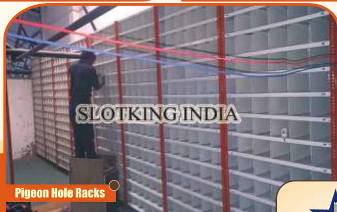
Pigeon Hole Racks