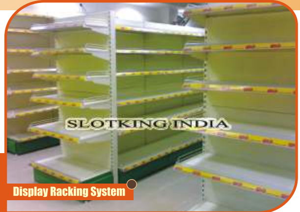
Display Racking System