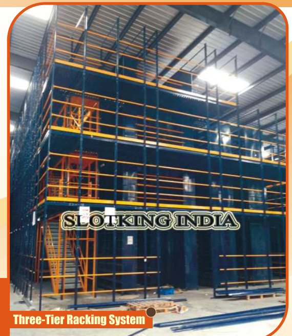
Three-Tier Racking System