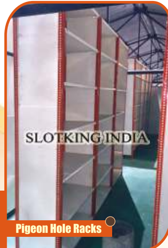
Pigeon Hole Racks