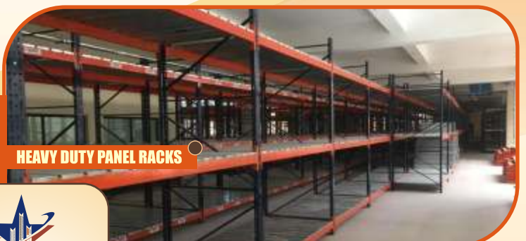
HEAVY DUTY PANEL RACKS