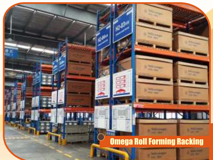
Omega Roll Forming Racking