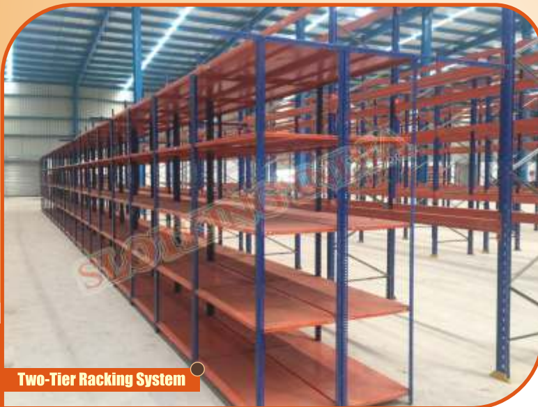
Two-Tier Racking System