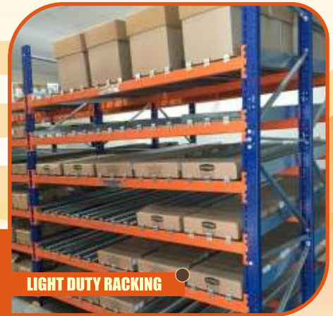
LIGHT DUTY RACKING