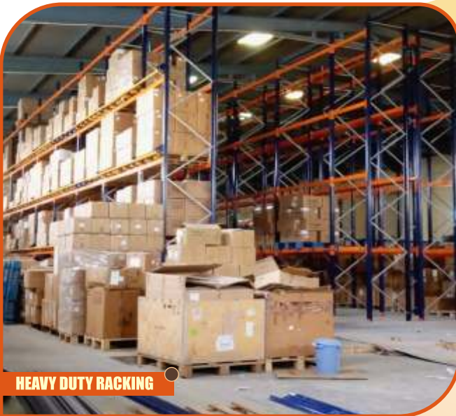
HEAVY DUTY RACKING