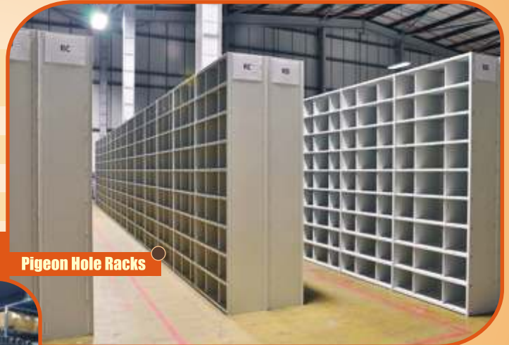
Pigeon Hole Racks