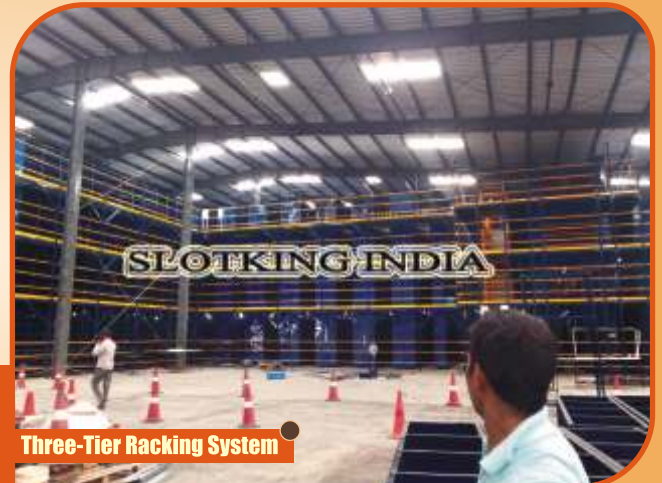
Three-Tier Racking System