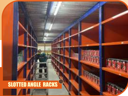
SLOTTED ANGLE RACKS