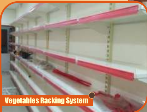
Vegetables Racking System