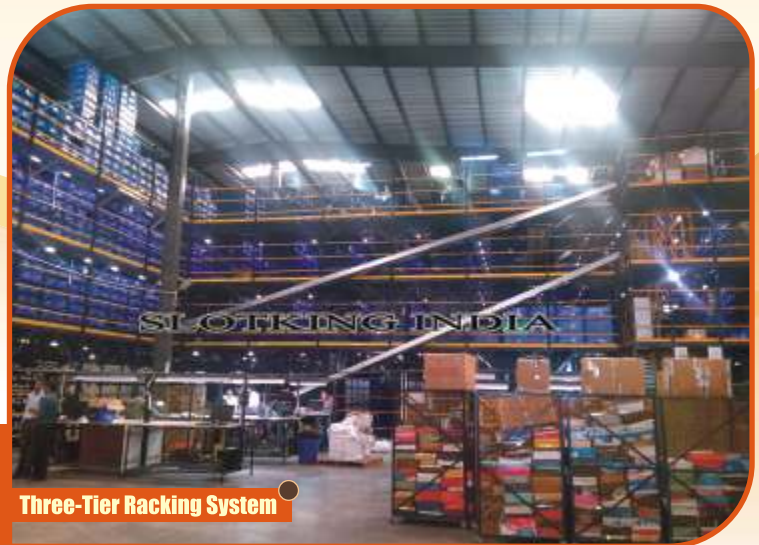
Three-Tier Racking System