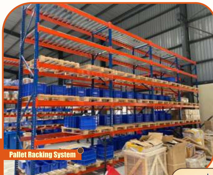
Pallet Racking System