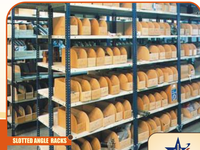
SLOTTED ANGLE RACKS