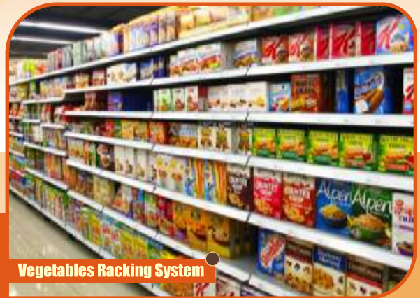
Vegetables Racking System