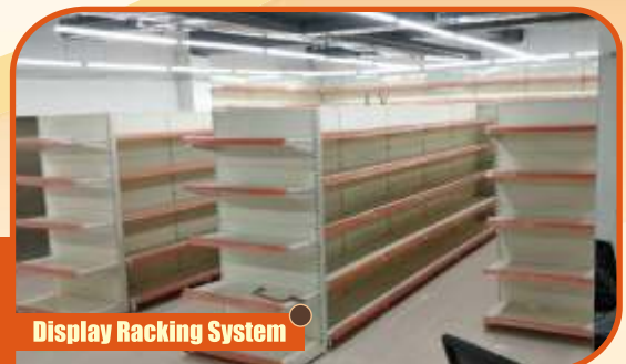
Display Racking System