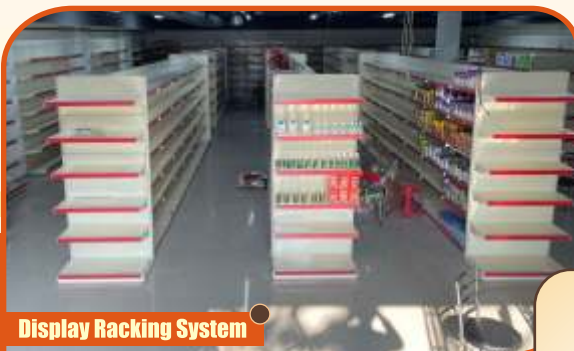
Display Racking System