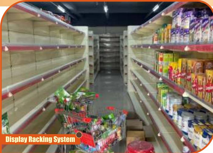
Display Racking System