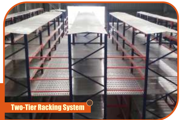
Two-Tier Racking System