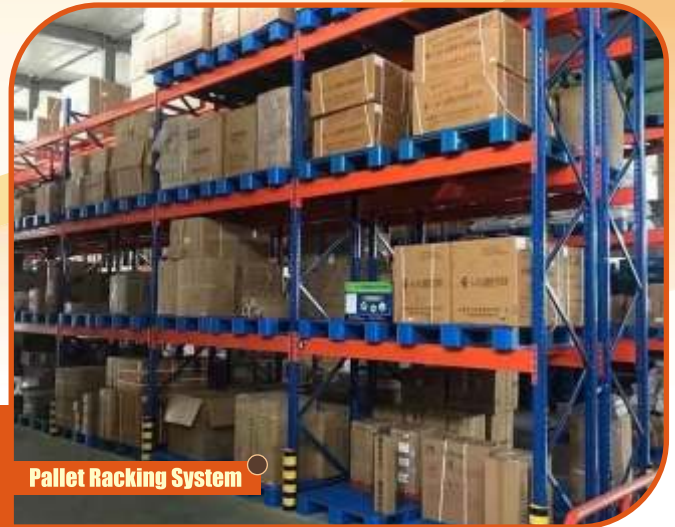
Pallet Racking System