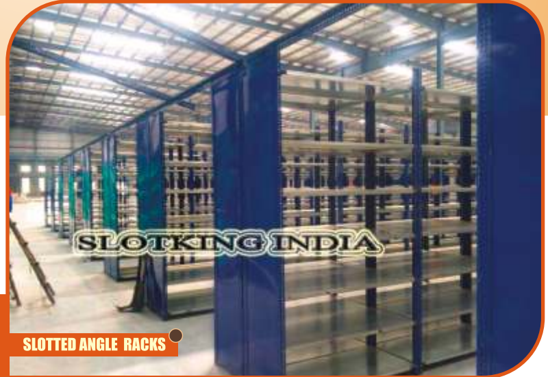
SLOTTED ANGLE RACKS