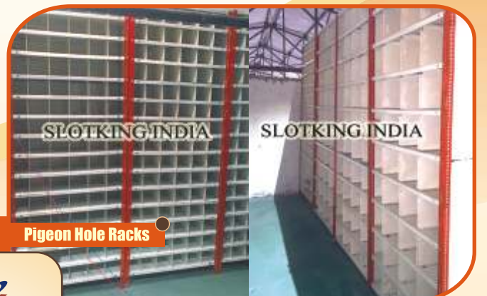
Pigeon Hole Racks