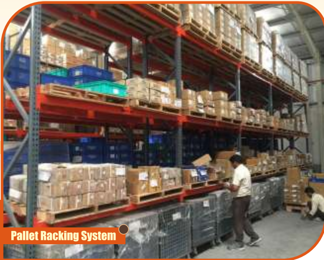
Pallet Racking System