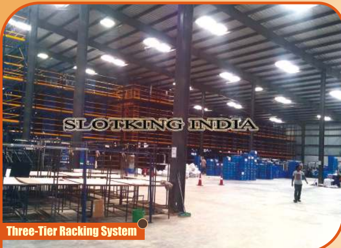
Three-Tier Racking System