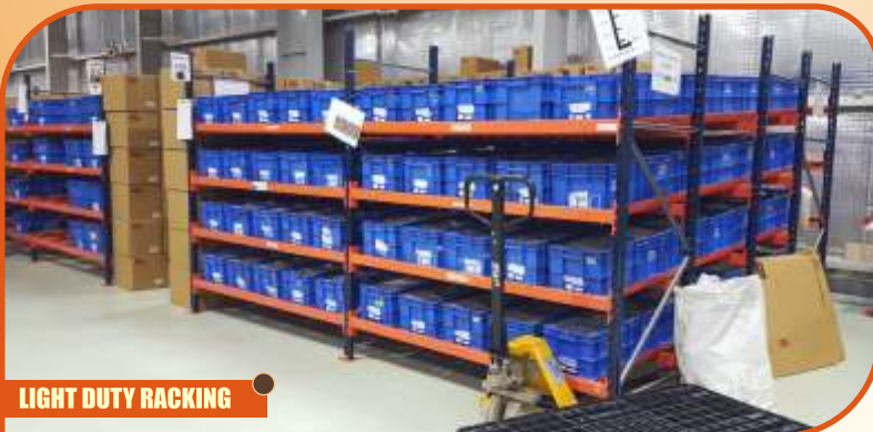
LIGHT DUTY RACKING