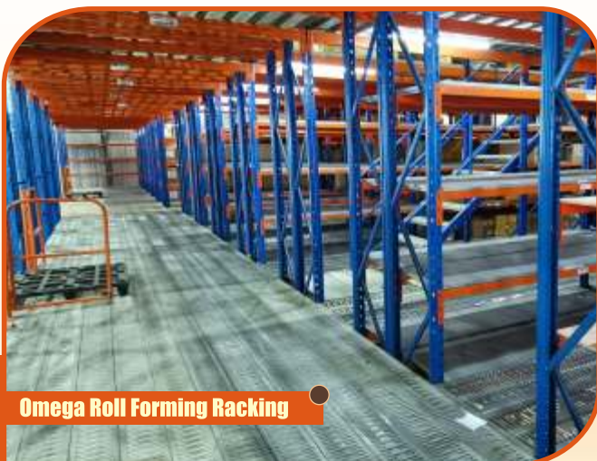
Omega Roll Forming Racking