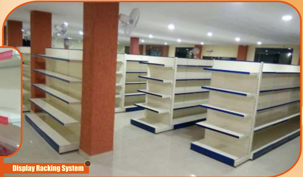
Display Racking System